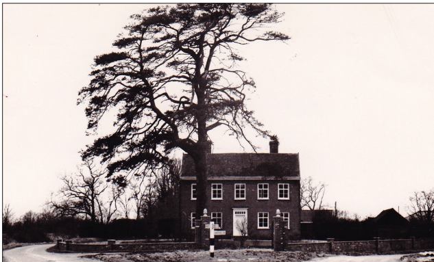
Moat House 1969 with a magnificent Scots Pine