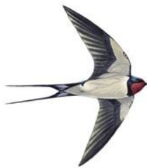
Long tail "streamers" of the male swallow

There appears to be a goodish number of swallows hunting over the ripening crops. If you get decent views of the swallows as they swoop over the fields you can usually tell the age and sex of the birds by the tail length; the streamers (as they are called) of the males are much more pronounced than the females', and theirs in turn are a little longer than the juveniles'.